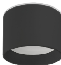
PIEDRA SURFACE BLACK

LED [CR] 12W 3000K - 1080lm / 5700K-1170 S D130 x H100 mm