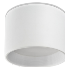
PIEDRA SURFACE WHITE

LED [CR] 12W 3000K - 1080lm / 5700K-1170 S D130 x H100 mm